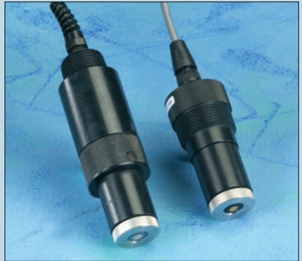
Submersion and Flowcell Sensors

For applications where the second analog output is desired or where alarm relay functions are needed, an AC powered system is available. Operation from AC power allows the user to utilize analog outputs for both chlorine dioxide and pH, or for independent PID and chlorine dioxide outputs, or simply for chlorine dioxide and temperature outputs.