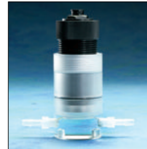
Low Volume Flowcell