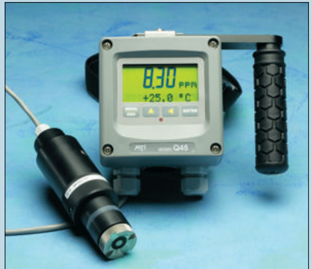
Portable Chlorine Dioxide Monitor

For even greater versatility, a portable unit powered by a standard 9 V battery is also available. The dual 0-2.5 VDC outputs are assignable to chlorine dioxide concentration and temperature. This instrument can be supplied with an internal data-logger, making it ideal for short term monitoring at remote sites. The unit will run for 10 days on a single battery, and the data-logger will store up to 32,000 data points, easily enough for 10 days of data at 1-minute intervals.