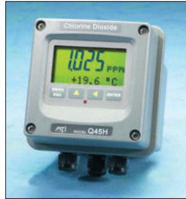
Chlorine Dioxide Monitor

The ATI Model Q45H/65 Residual Chlorine Dioxide system responds to chlorine dioxide with minimal interference from any residual chlorine that may be present.