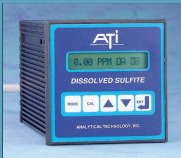
Panel mount monitor