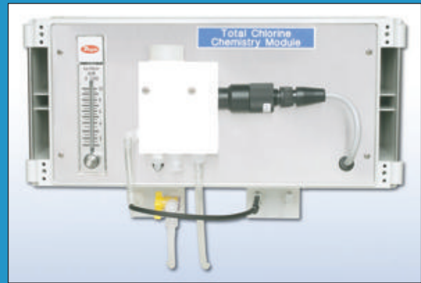
Air-Stripping Chemistry Module

Sample is connected to the inlet overflow assembly using 1/4" I.D. flexible tubing. Recommended sample flowrate is 3-30 gallons per hour (.2-2 LPM.). While the monitor uses only a small fraction of this sample, higher flow keeps sample delivery times to a minimum. Excess sample simply overflows into a drain chamber. A 1/2" I.D. hose barb is provided for connection of drain tubing.