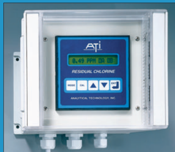
NEMA 4X Monitor