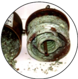
Hot Water System without CALGON ® SHMP

CALGON ® SHMP prevents calcite crystal growth, allowing the calcium to be maintained in a soluble form when water is passed through household appliances.