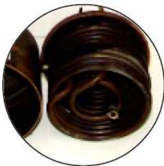
Hot Water System with CALGON ® SHMP