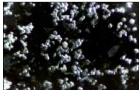
Crystal Formation CALGON ® SHMP Treated

CALGON ® SHMP prevents calcite crystal growth, allowing the calcium to be maintained in a soluble form when water is passed through household appliances.