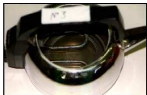
Kettle with CALGON ® SHMP