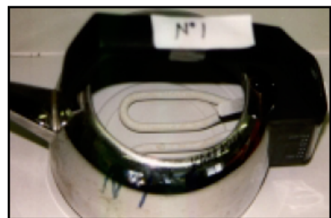
Kettle without CALGON ® SHMP