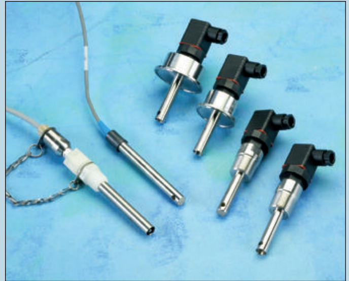
2 Electrode Sensors

The sensor should be installed horizontally with the electrodes directed into the on-coming flow of water. This prevents air bubbles and particulates from collecting in the space between the two electrodes. Any obstruction