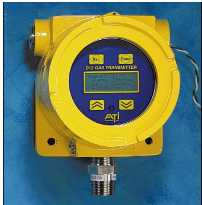
D12-IR Gas Transmitter

For plants operating with HART™ protocol communications systems, the D12-IR can be supplied with this option. Our HART™ output supports both 4-20 mA and constant current mode of operation.