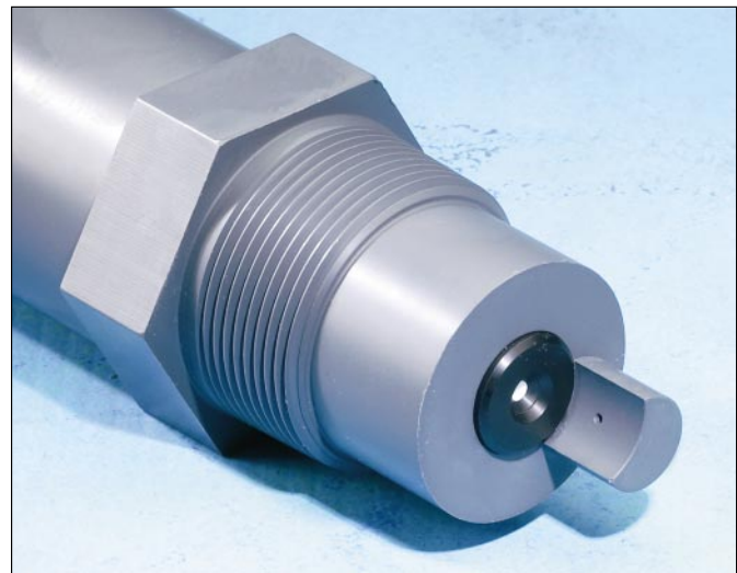
An optional air-purge system controlled by the transmitter will periodically deliver a blast of air across the critical sensor surfaces to remove water droplets.

battery and contains a data-logger for collecting information on existing air collection systems. A standard 9 volt battery will operate the unit for 4 days, while a 9 volt lithium battery will provide about 10 days of operation. Data is easily downloaded to a standard PC using software supplied with the unit.