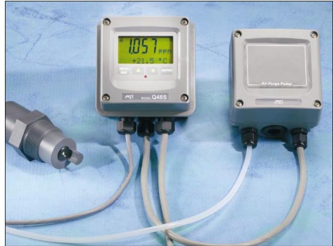
Q45S Monitor and Sensor

A special battery-powered version of the Q45S is available for use in temporary installations. This system runs on an internal 9 volt