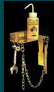
WALL MOUNTED CHAINING BRACKET INCORPORATES HOOKS FOR STORING CYLINDER CHANGE-OUT TOOLS AND WASHERS

THE ELECTRONIC CHLOR-SCALE® 150 IS DESIGNED TO MONITOR 150 LB CHLORINE AND SO 2 CYLINDERS USED AT WATER TREATMENT PLANTS, BOOSTER STATIONS, WELL HEADS AND VARIOUS INDUSTRIAL PROCESS PLANTS. BY MEASURING THE WEIGHT OF THE CHEMICAL IN THE CYLINDER, OPERATORS CAN EASILY TRACK EXACTLY HOW MUCH CHEMICAL HAS BEEN USED, THE CURRENT FEED RATE, AND HOW MUCH CHEMICAL REMAINS.