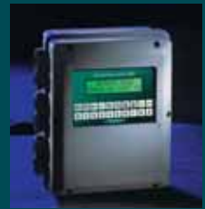
OUR ADVANCED WIZARD 4000® DIGITAL INDICATOR SIMULTANEOUSLY MONITORS REMAINING CHEMICAL, FEED RATE AND USAGE ON UP TO 4 SEPARATE CYLINDERS