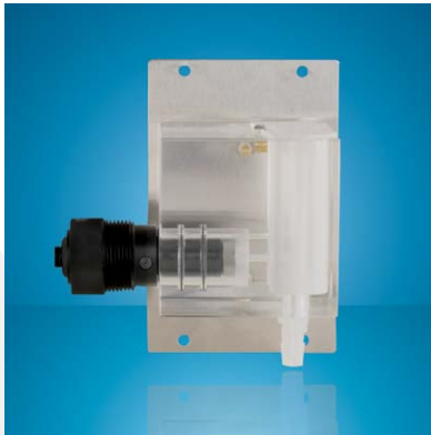
Constant Head Flowcell