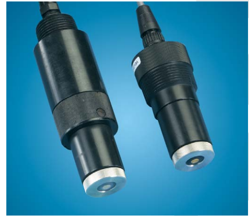
Submersion and Flowcell Sensors

Submersible combined chlorine sensors can sometimes be used for measuring total chlorine in wastewater effluent. Wastewater effluents containing more than 1 PPM of ammonia, often result in a chlorine residual that is more than 90% monochloramine. Direct measurement with a submersible sensor can provide a dependable monitor without all the sampling and chemicals associated with total chlorine measurement.