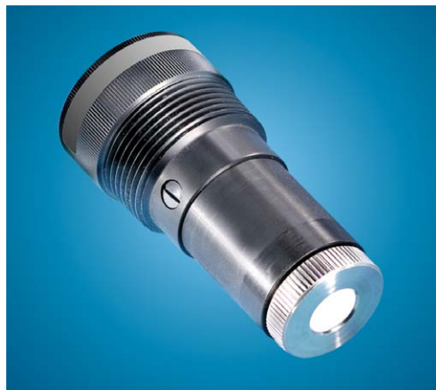
Q46H Flowcell Style Sensor

ATI's Model Q46H Chlorine Monitor is an upgraded version of our proven Q45H system for continuous monitoring of free or combined chlorine. Monitor capabilities have been expanded to include options for a 3rd analog output or for adding additional low power relay outputs. Digital communication options for Profibus, Modbus, or Ethernet have been added as well.