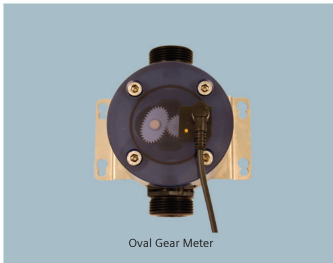
Oval Gear Meter

This optional diaphragm leak detection system senses the early stages of diaphragm failure.